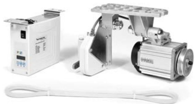
TEXI POWER 750 S